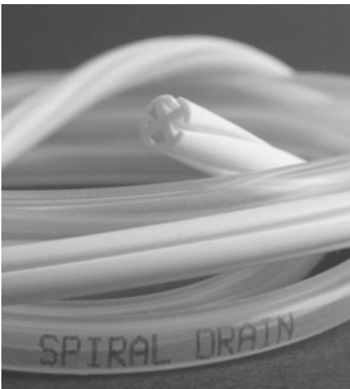
Fig. 1. Spiral Drains are white, radiopaque silicone drains with four helical channels along the center core. Spiral profile helps to prevent kinking effect when drain is positioned in curved placements (with permission of Redax® srl Poggio Rusco Mantova, Italy).

The spiral drain is made of biocompatible radiopaque silicone with four helical channels along the center core. Drain components consist of a silicone spiral drainage section and a silicone extension tube (Fig.1-2).